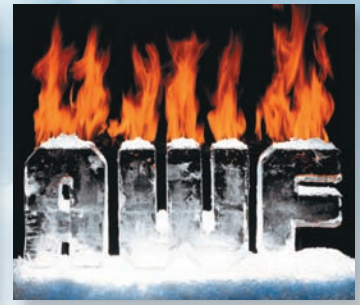
Sullair AWF Compressor Fluid Improved hot and cold weather lubrication. Longer compressor fluid life. Extended air end warranty.