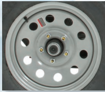
Wheel Bearing Grease Fitting Offers convenient wheel bearing lubrication thru zerk fittings.