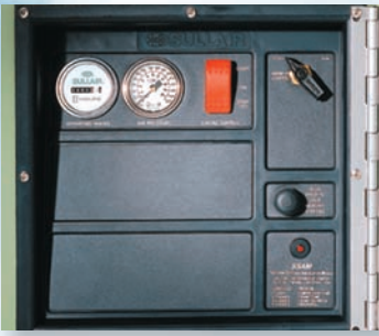
Curbside Instrument Panel Featuring SSAM Shutdown System & Annunciation Module.